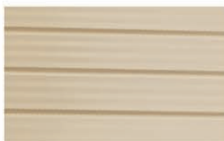
Apollo Unilink 2000 Mark II® (Not suitable for cyclonic regions)