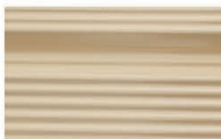
Apollo Unilink 2000®

Apollo Patios® has a range of colours that will fit perfectly with your homes existing colour scheme. All colours in the Apollo Patios® range have also been specifically chosen to suit the climate we live in.